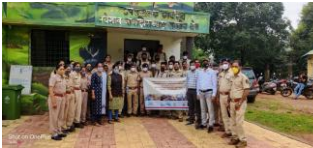
Figure 1 Participants of the forensic training program

Frontline staff of the forest department is the army of green warriors. Strengthening this green army will boost our conservation efforts at ground level.