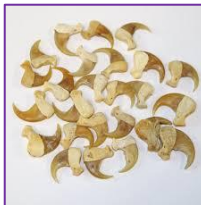
Figure 3 Tiger claw