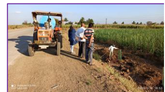
Figure 2 Plantation site at Satara district