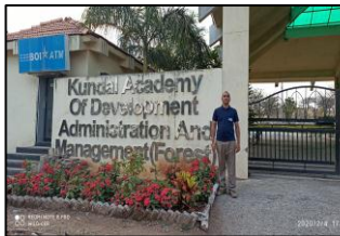
Figure 4 Forty five rangers were oriented about the rescue and rehabilitation of wild animals at Kundal Academy of Forest Department