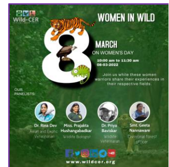
Poster of 'Women in wild'

Wild-CER was happy to host this event with all the dignitaries and participants.