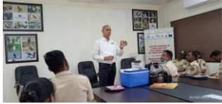
Wildlife forensic training at Navegaon Nagzira Tiger Reserve

One day training on 'Wildlife investigation through forensic techniques' was successfully organized in March 2022 for frontline staff of the Navegaon-Nagzira Tiger Reserve (NNTR), Maharashtra.